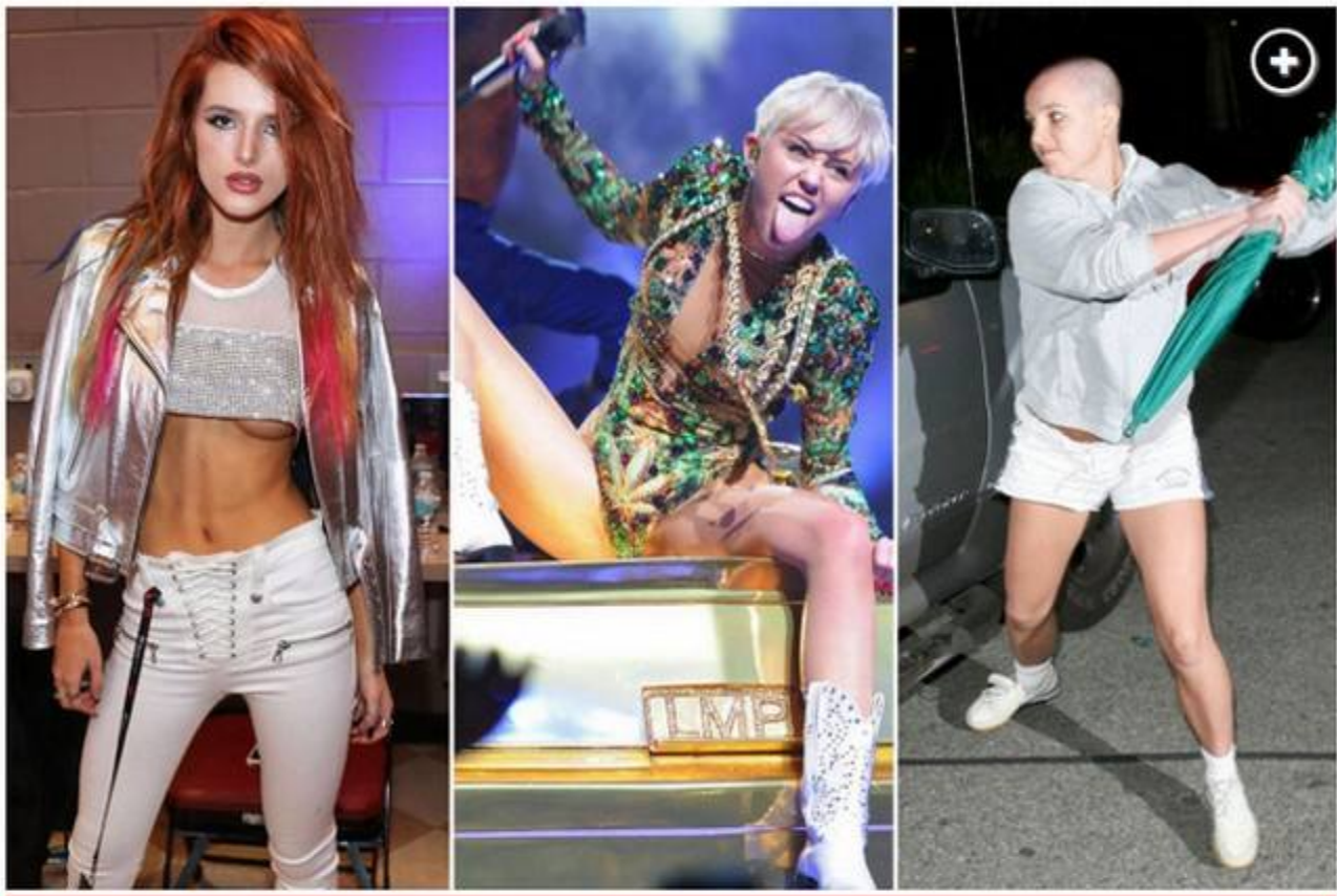
Bella Thorne, Miley Cyrus in 2014 and Britney Spears in 2007.

Turned into lesbians and slut-lifestyle promoters – Disney’s dark sexual executive pressures are devastating for the children who work for the Disney brand.