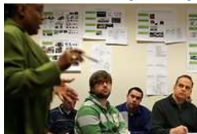
After Bright Automotive decided to shut down its operations, it held a meeting on Michigan unemployment benefits.