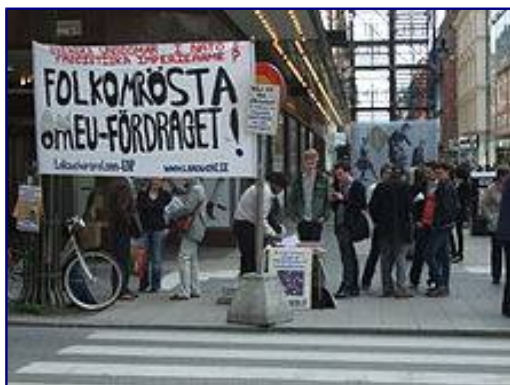
LaRouche Movement members in Stockholm protesting against the Treaty of Lisbon .