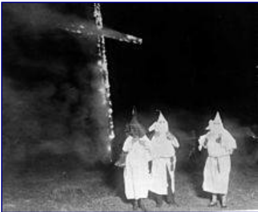
Cross burning by Ku Klux Klan members in 1915.

Sociologist and historian Orlando Patterson has described the Ku Klux Klan , which arose in the American South after the Civil War , as a heretical Christian cult, and he has described its persecution of African Americans and others as a form of human sacrifice . [118] Secret Aryan cults in Germany and Austria in the nineteenth and early twentieth centuries had a strong influence on the rise of Nazism . [119] Modern Skinhead groups in the United States tend to use the same recruitment techniques as destructive cults. [120]