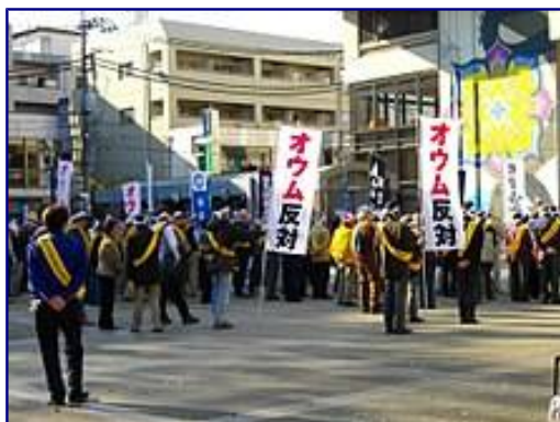
Anti- Aum Shinrikyo protest in Japan